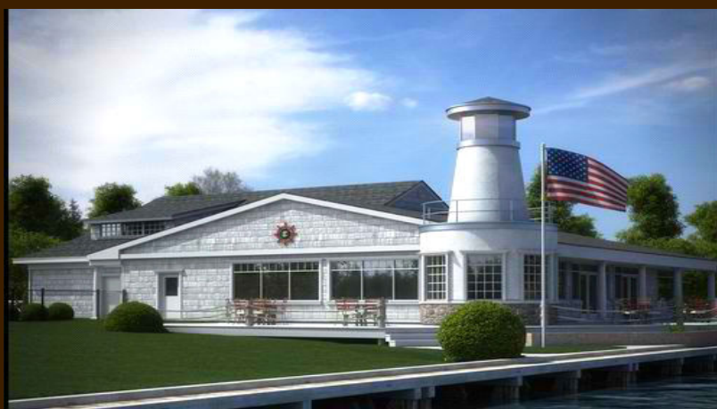
Plans include a new light house to serve as a landmark for boaters and paddlers on the Fox River

DNR, state and city officials, the Club has just began construction on an expansion and renovation in October.