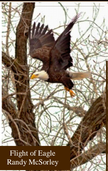
Flight of Eagle Randy McSorley

Friends of the Fox would like to invite our friends, neighbors, partners and supporters to participate in the Fox-Wisconsin Heritage Parkway stakeholders workshop to be held November 15-17th. The workshop will be representing each segment of the Parkway in locations convenient to each segment-- Upper Fox, Lower Fox and Lower Wisconsin Rivers.