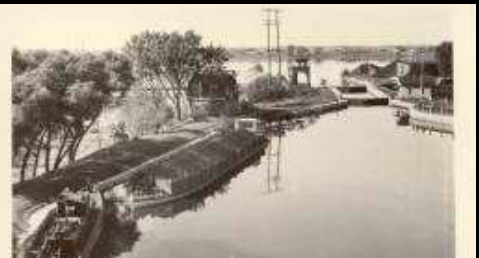
DePere Lock and House 1915