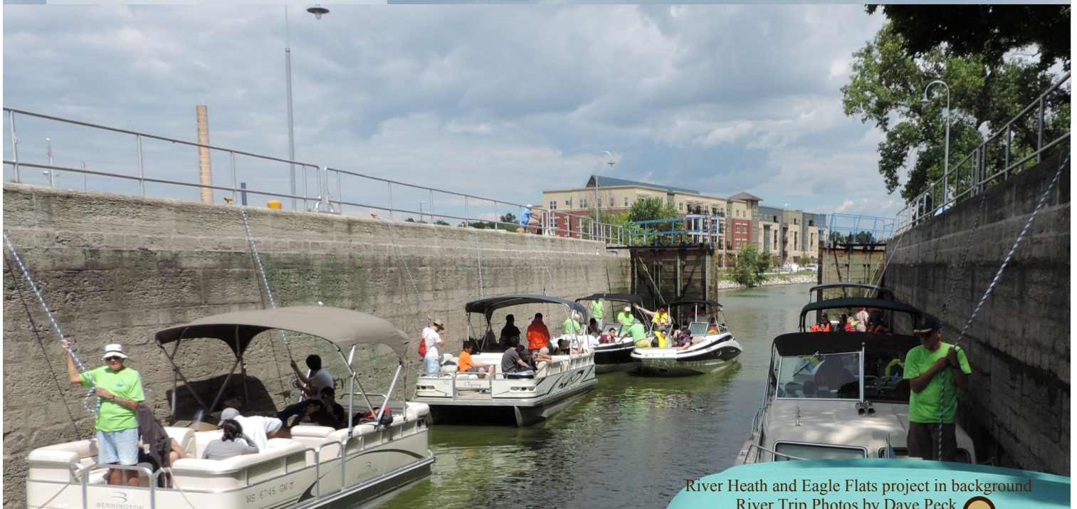
River Heath and Eagle Flats project in background River Trip