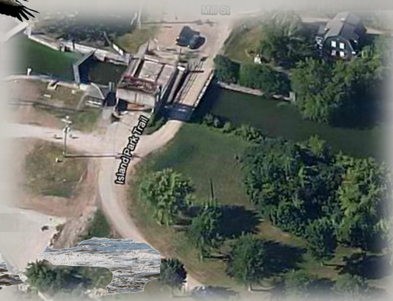
Pelicans on Water