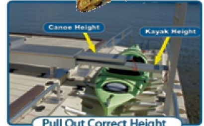
Pull Out Correct Height